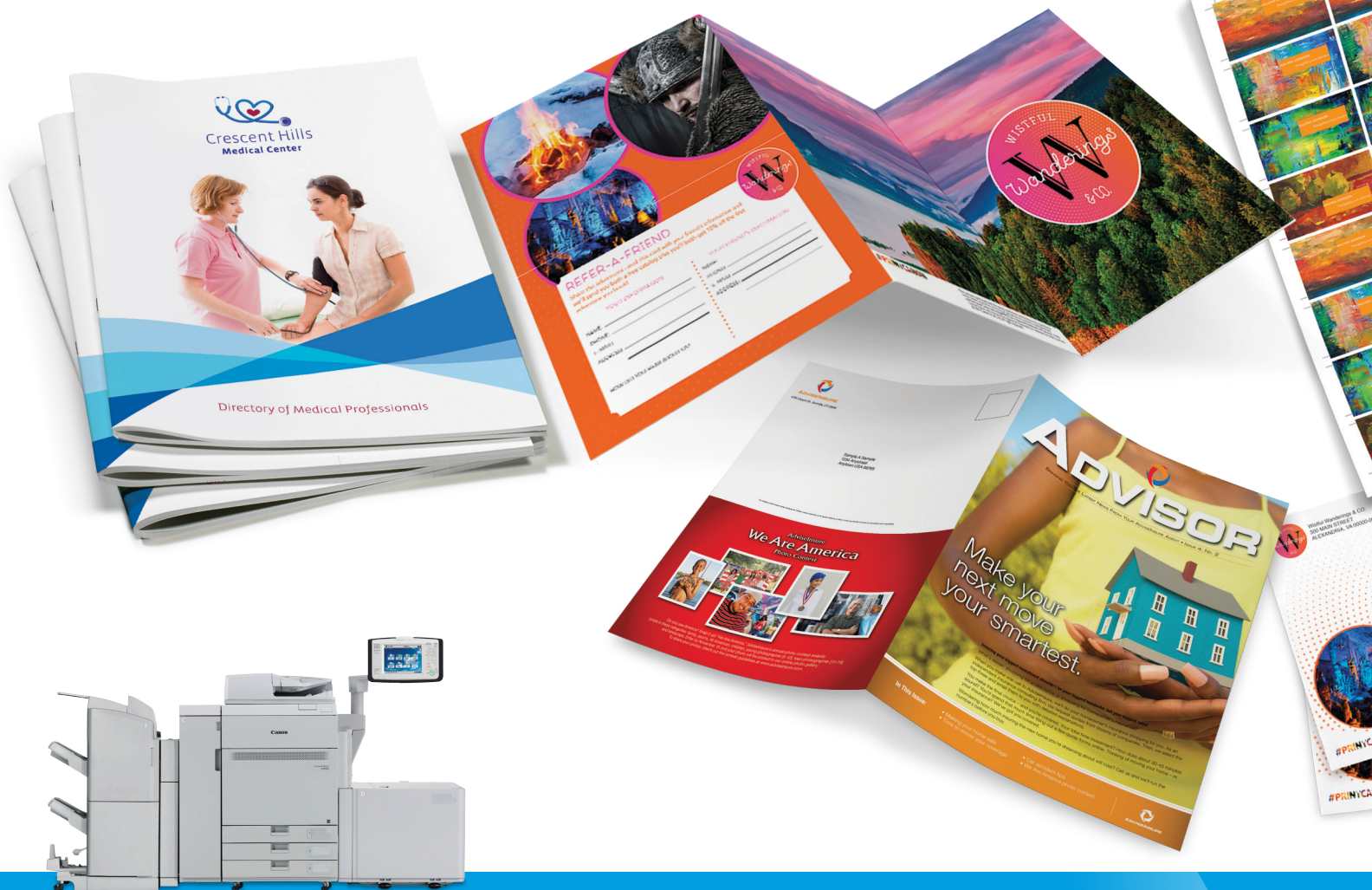
Engine shown with optional accessories.